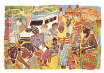
What Can I Do?

YGL published it's first Annual Report late last year. A preview was shared on YGL's Blog but you can also view the complete report here.