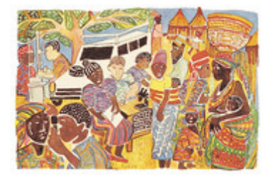
What Can I Do?

Being a YGL Member presents you with a unique opportunity to become a change agent in your workplace and in your community. Find out how to get involved here.